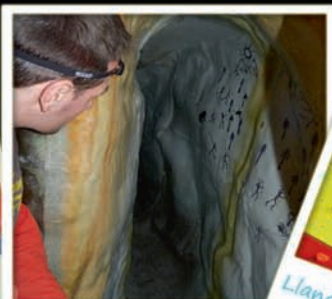
Condover Hall Cave System