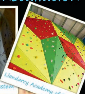
Llandarcy Academy of Sport