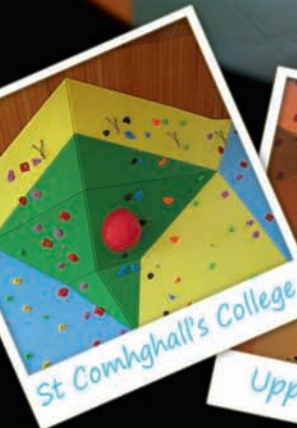
St Comhghall's College