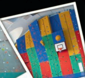
Trinity at Bowes